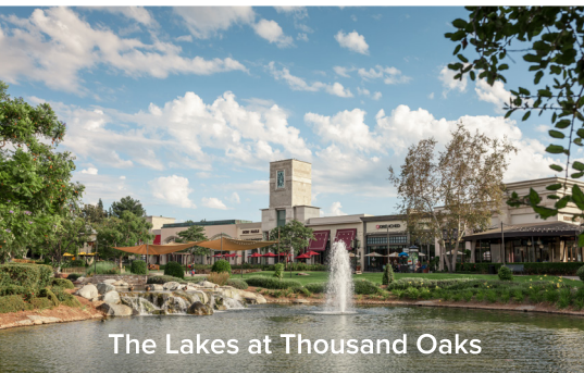
The Lakes at Thousand Oaks